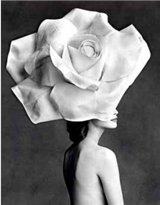
Patrick Demarchelier - Rose