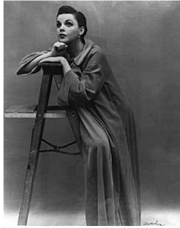
Richard Avedon portrait of Judy Garland