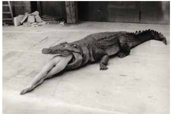
Helmut Newton - figure study