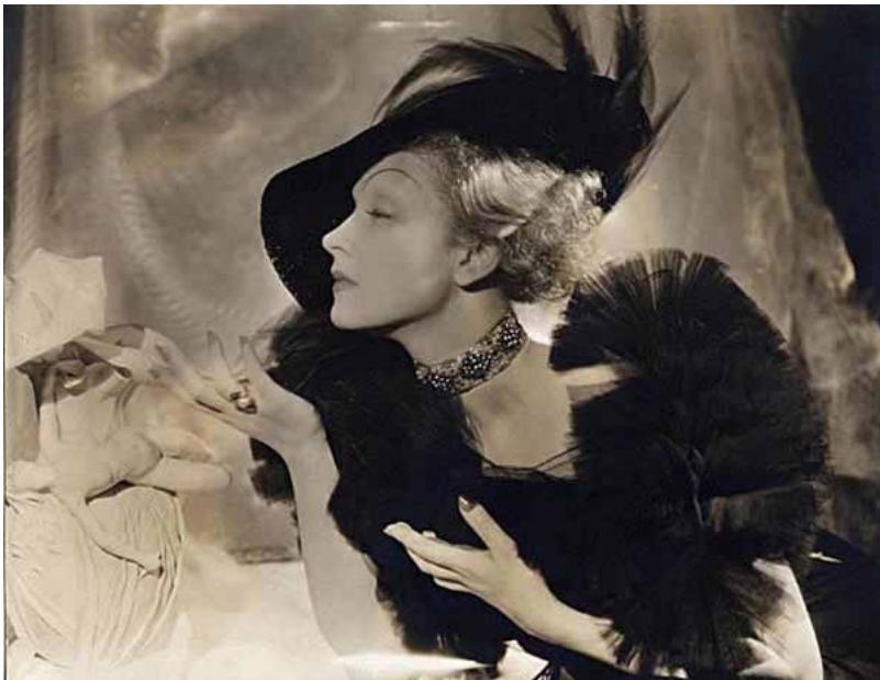
Cecil Beaton portrait of Marlene Deitrich