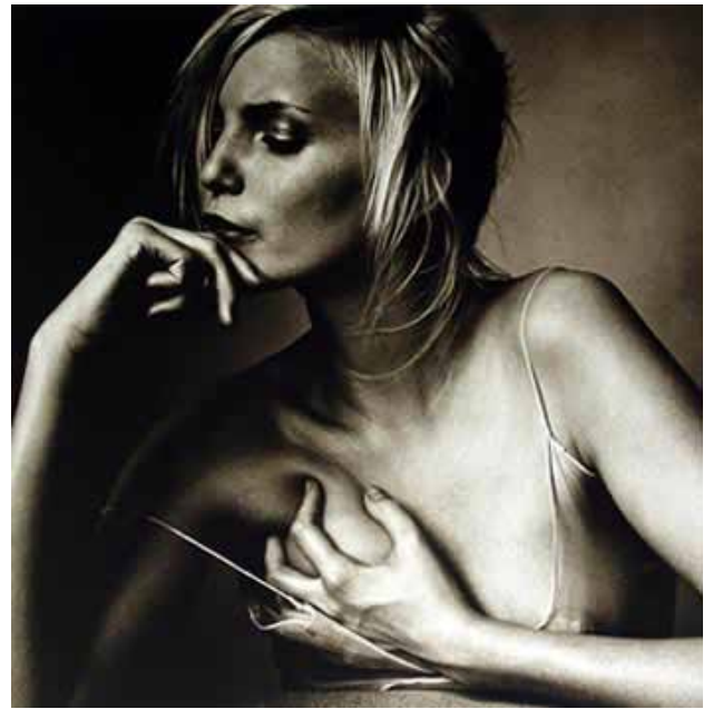
Irving Penn - Nadja